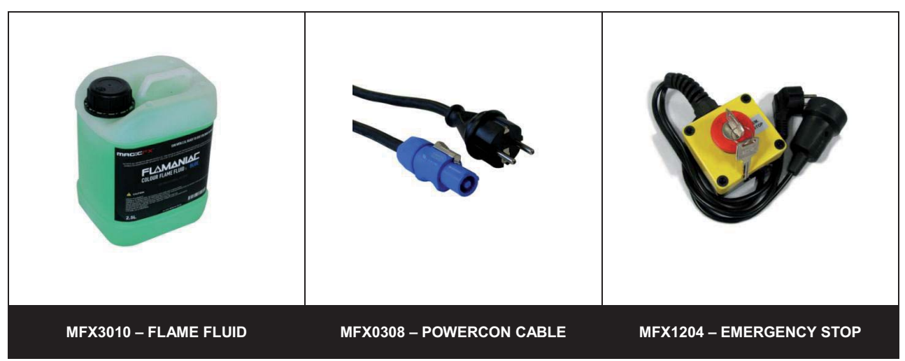
Figure 9: Accessories Flamaniac

The items listed can be ordered from your MAGICFX® distributor. Locate a distributor near to you by contacting;